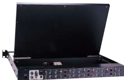
No special cables required, up to 8 computers connection!

No special cables required to connect up to 8 computers! Five functions: LCD monitor, keyboard, mouse, speaker and KVMA switch