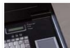
Outstanding LCD Module · Display station number · Auto scan or user manually selected setting