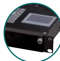
LKM-9268G Two self-click prevents the keyboard from sliding in shaking

No special cables required to connect up to 8 computers! Five functions: LCD monitor, keyboard, mouse, speaker and KVMA switch