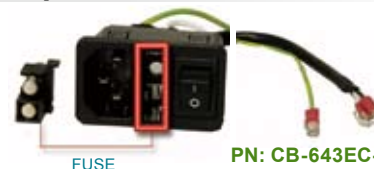
PN: CB-643EC-RS 20 cm AC input cable with fuse